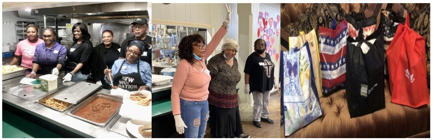
Prepared/served lunch at the Charlotte Rescue Mission and donated bags of books for children at the Hope Center.