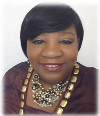
Minister Lyddia Hancock